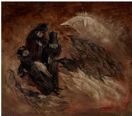
LEONORA CARRINGTON (1917-2011) Pig-rush (Nacimiento de cerdos) signed and dated 'Leonora Carrington 1960' (lower left) oil canvas 31½ x 35½ in. (80 x 90 cm.) Painted in 1960. Estimate: $1,000,000-1,500,000