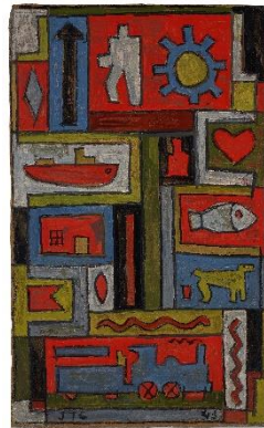
JOAQUÍN TORRES-GARCÍA (1874-1949) Forma con estructura y objetos (Form with structure and objects) signed 'JTG.' (lower left) and dated '43' (lower right) oil on board 32½ x 20 in. (83 x 51 cm.) Painted in 1943. Estimate: $600,000-800,000