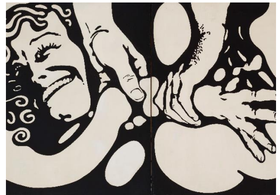
JORGE DE LA VEGA (1930-1971) Rompecabezas (2 panels) acrylic on canvas 39½ x 39½ in. (100 x 100 cm.) each panel 39½ x 79 in (100 x 200 cm.) overall Diptych. Painted 1969-1970. Estimate: $250,000-350,000